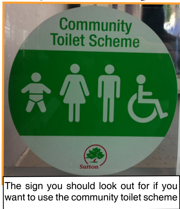
The sign you should look out for if you want to use the community toilet scheme

Commenting on the community toilet scheme Cllr Graham Tope said "I'm sure that the local residents will be pleased to know they have free